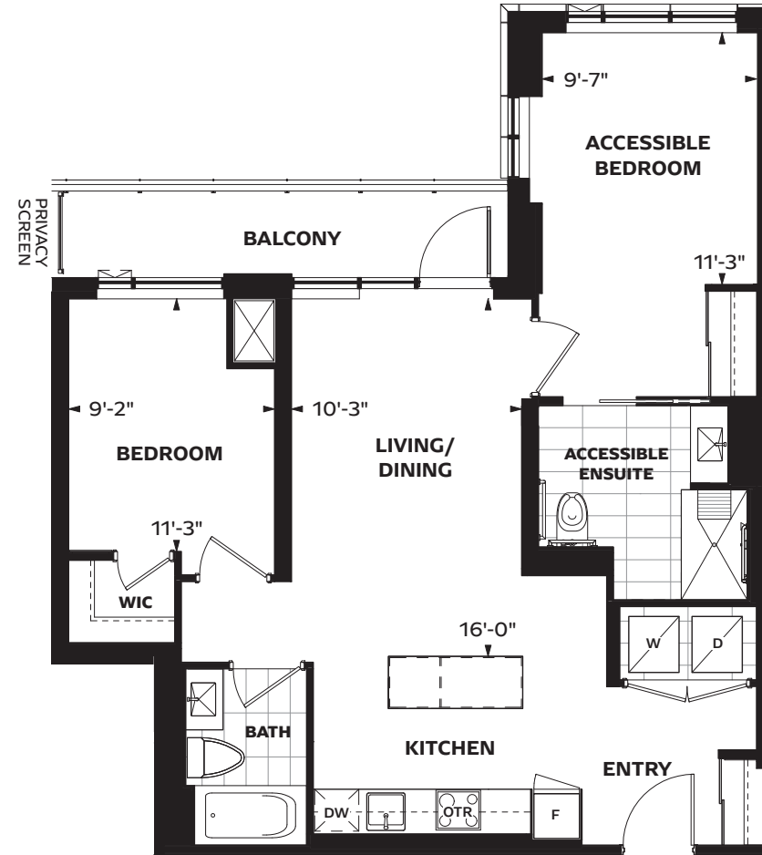
Alternate ADP Kitchen